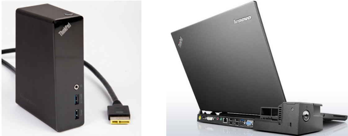
Figure 0-1: Lenovo docking station, using a cable connection and vertical dock (left), Lenovo docking station, using a horizontal dock with built in connector (right) (Source: Lenovo).

When I say "portable computer" I'm referring to a tablet, netbook, hybrid/ 2 in 1, Ultrabook or laptop.